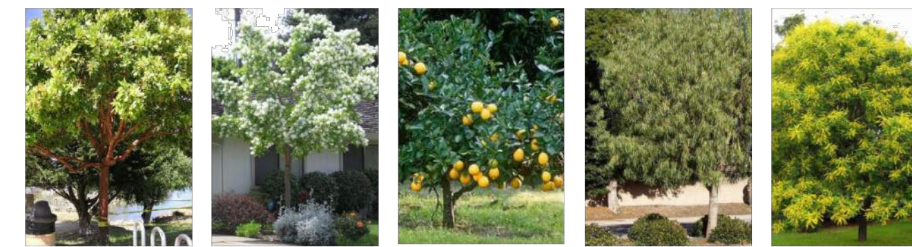
T-1 T-2 T-3 T-4 T-5

PLANT MATERIAL HAS BEEN SELECTED BASED ON THE SPECIFIC PLAN AND FURTHER REFINEMENT OF SPECIES SELECTION BY CITY OF PASO ROBLES AND LANDSCAPE ARCHITECT CONSULTANT.