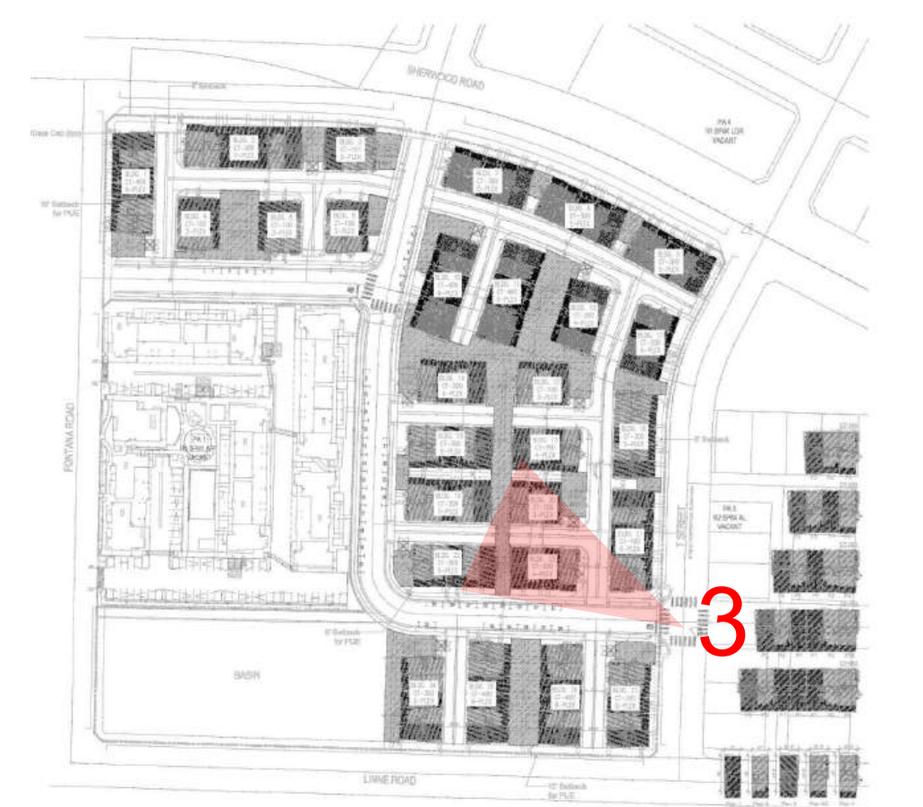
VIEW FROM CORNER OF INTERNAL STREET AND T STREET