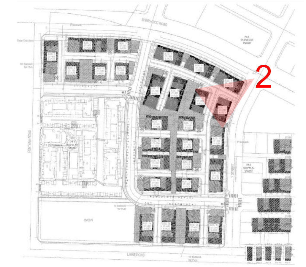
VIEW FROM CORNER OF SHERWOOD ROAD AND T STREET