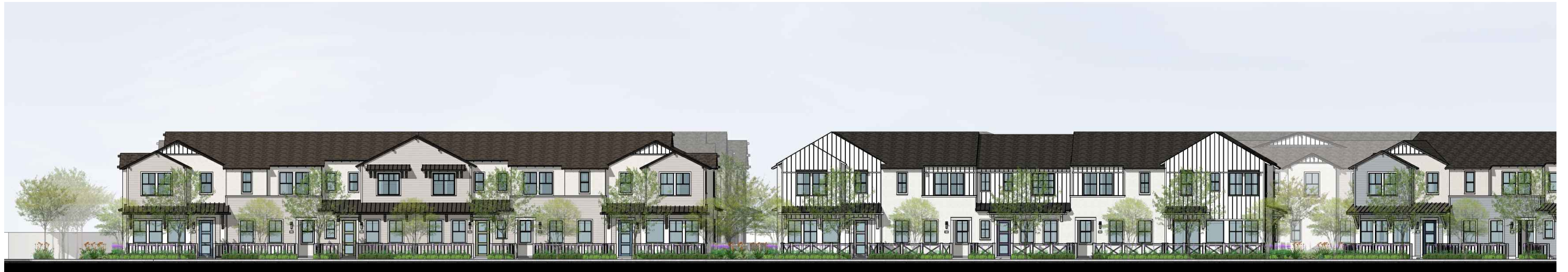
STYLE B - COMMERCIAL AGRARIAN