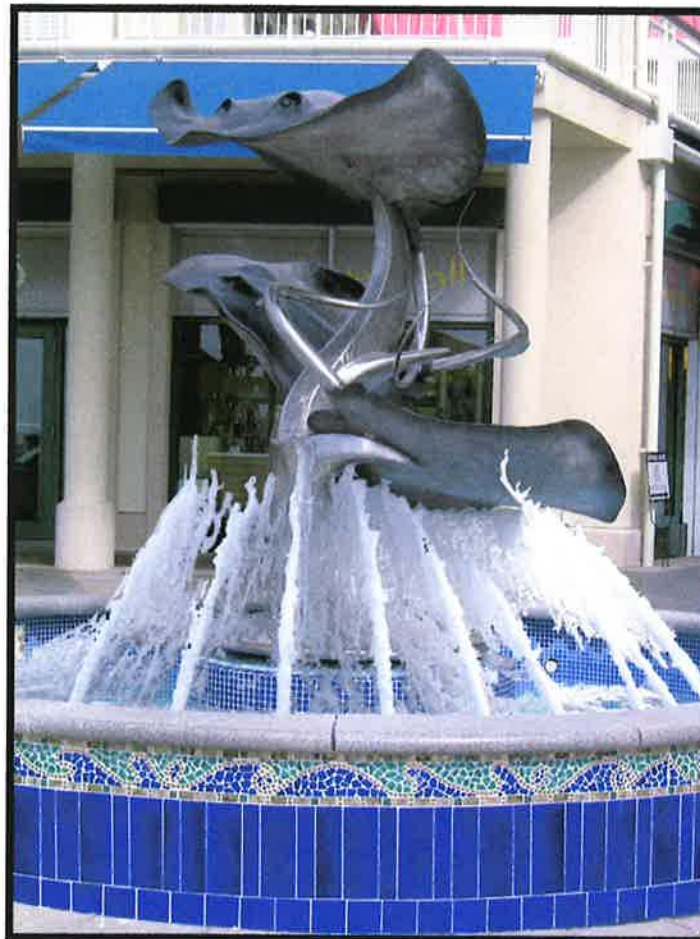
Sting Ray City Grand Cayman Island