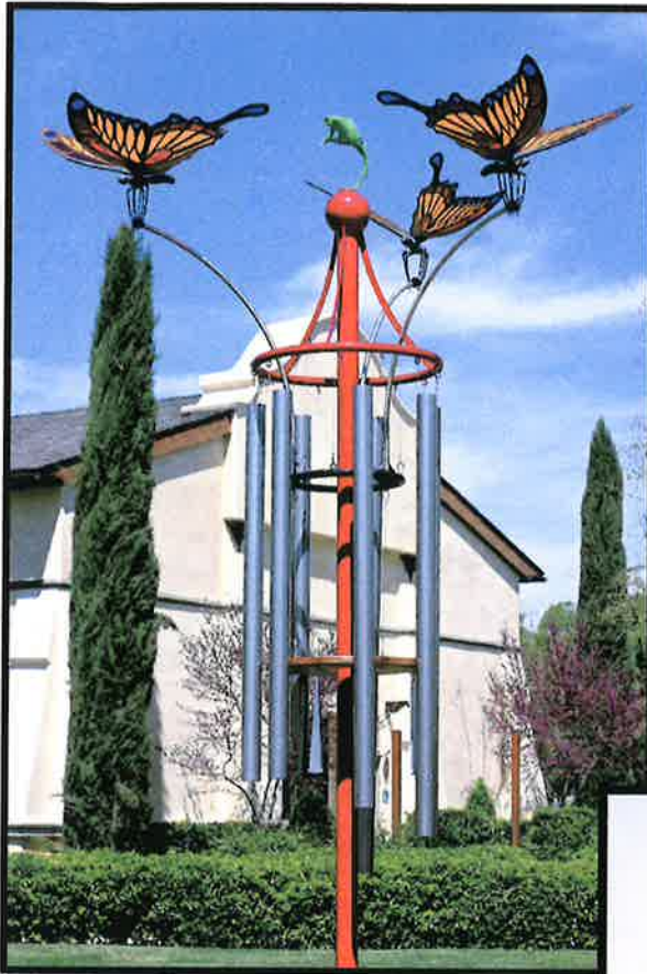
Butterfly Wind chime Sculpterra Winery