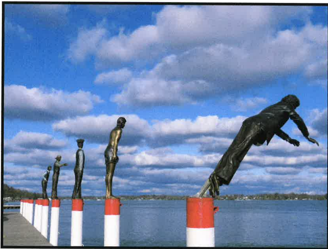
St. Clair Inn St. Clair, Mi.