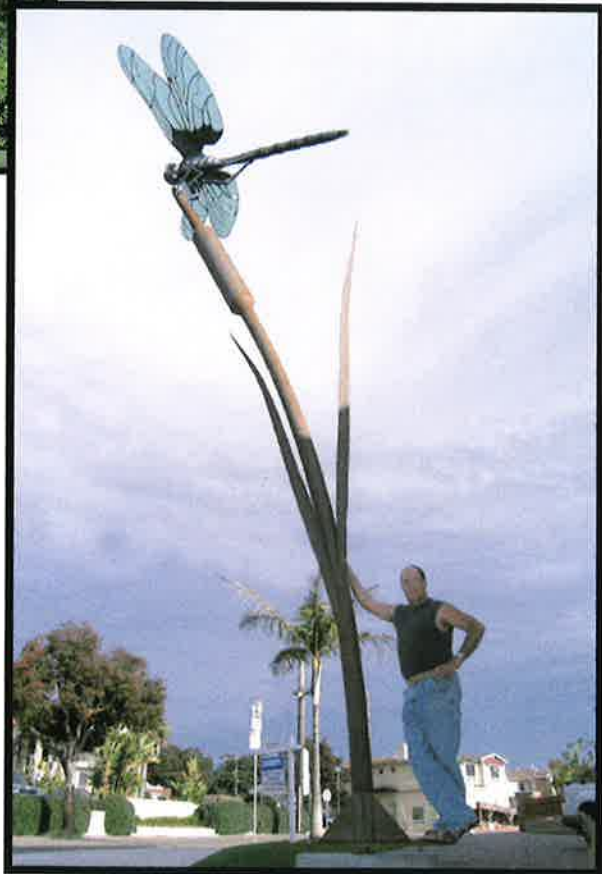
Mega Dragon Templeton, CA.