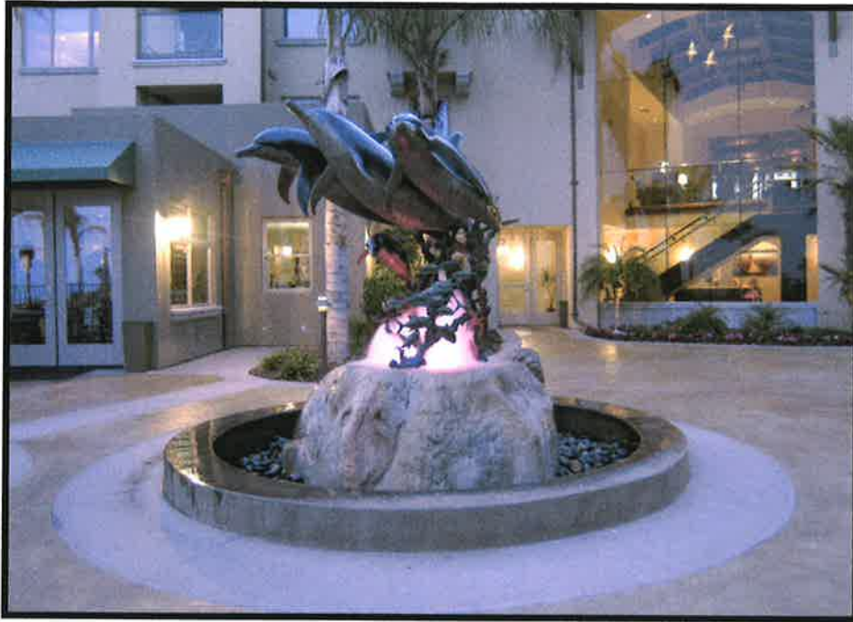
Dolphin Bay Resort Shell Beach, CA.