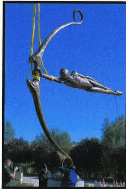
Mega Focus Sculpterra Winery