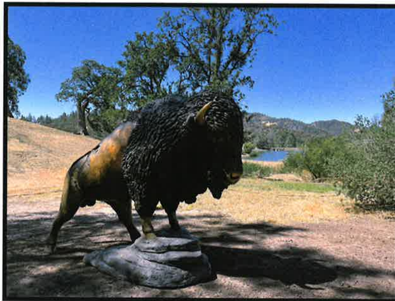
Bison Bison Ranch, CA.