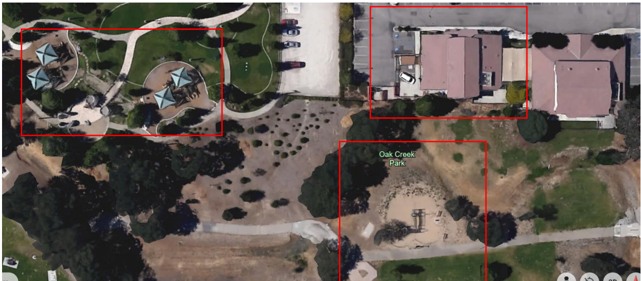
Figure 2 Oak Creek Park Sandbox, Sherwood Forest Playground, Veterans Memorial Building

One area of interest for such a memorial is a vacant circular sandbox immediately behind the Veterans Memorial Building. Due to safety issues, the playground in this sandbox was removed in 2022. With a limited budget and an active playground at the adjacent Sherwood Forest Park approximately 400 ft from the vacant sandbox, there is currently no replacement plan in place.