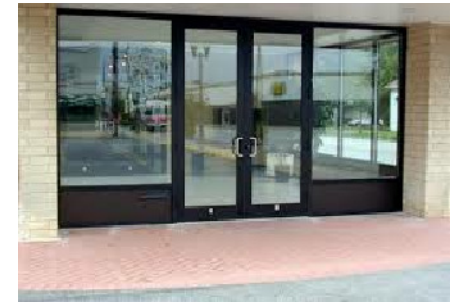
W-1 WINDOWS AND STOREFRONT "DARK BRONZE"