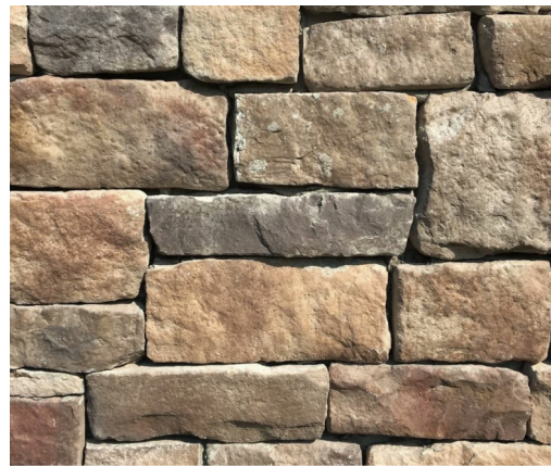
M-1 MASONRY/STONE NATURAL LIMESTONE W/ VARIED BROWN & GRAY TONES ASHLAR PATTERN MANUF: TBD