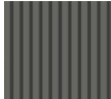
R-1 METAL ROOF AEP SPAN PBR "COOL ZINC GRAY"