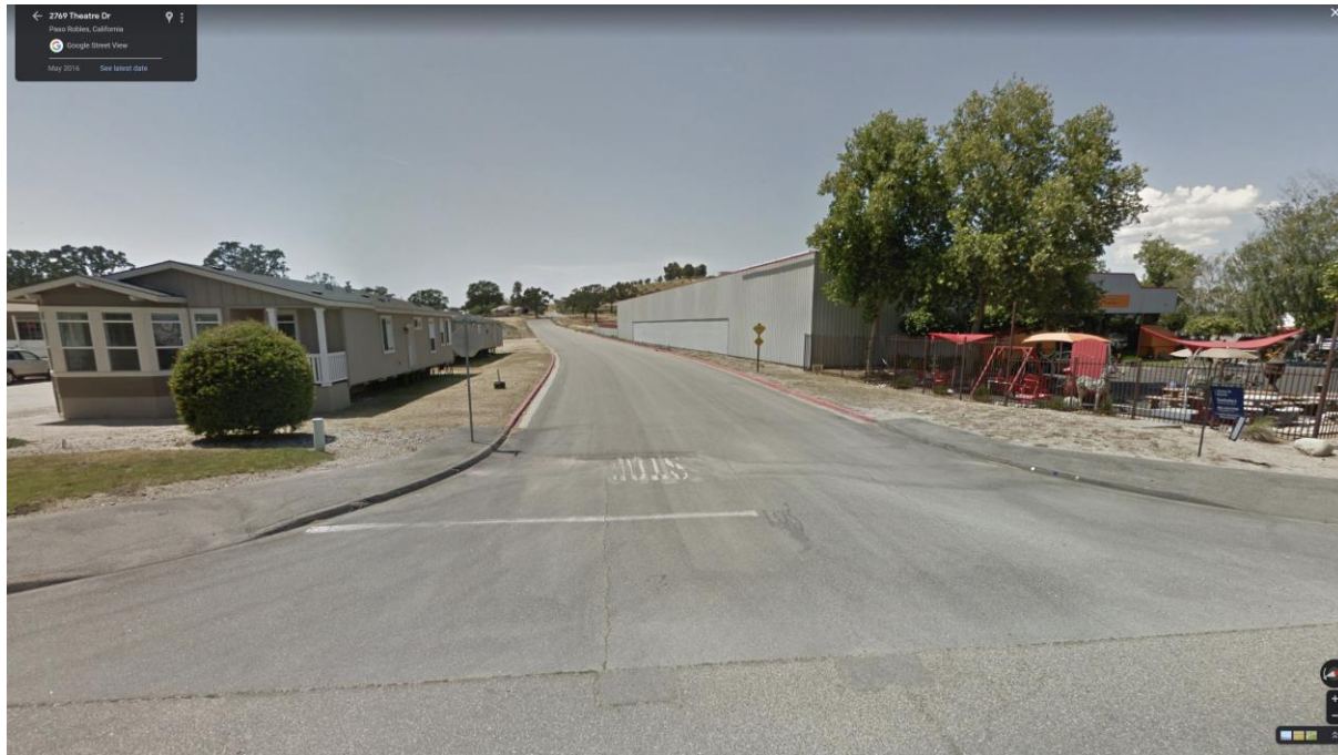
Nutwood Circle looking west from Theatre Drive.