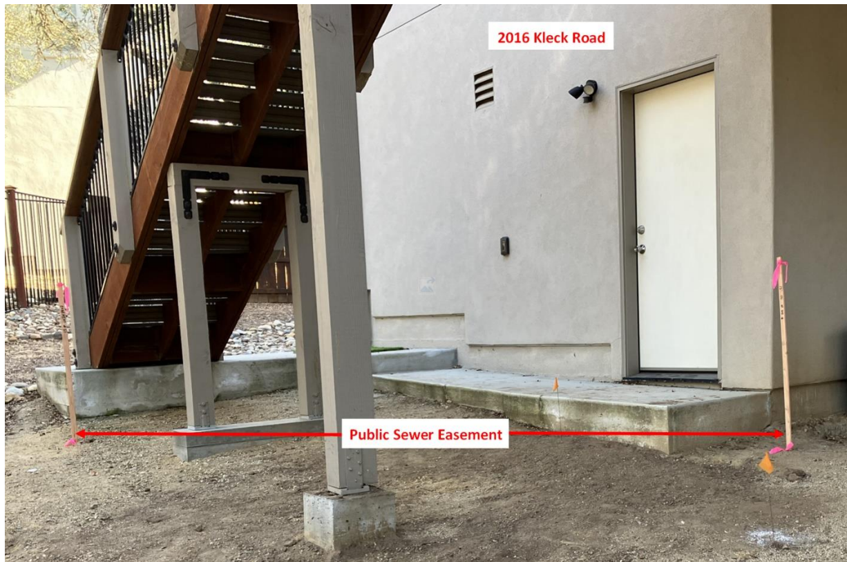
Figure 1b – Site Photo Showing 2016 Kleck House located in Existing Public Sewer Easement