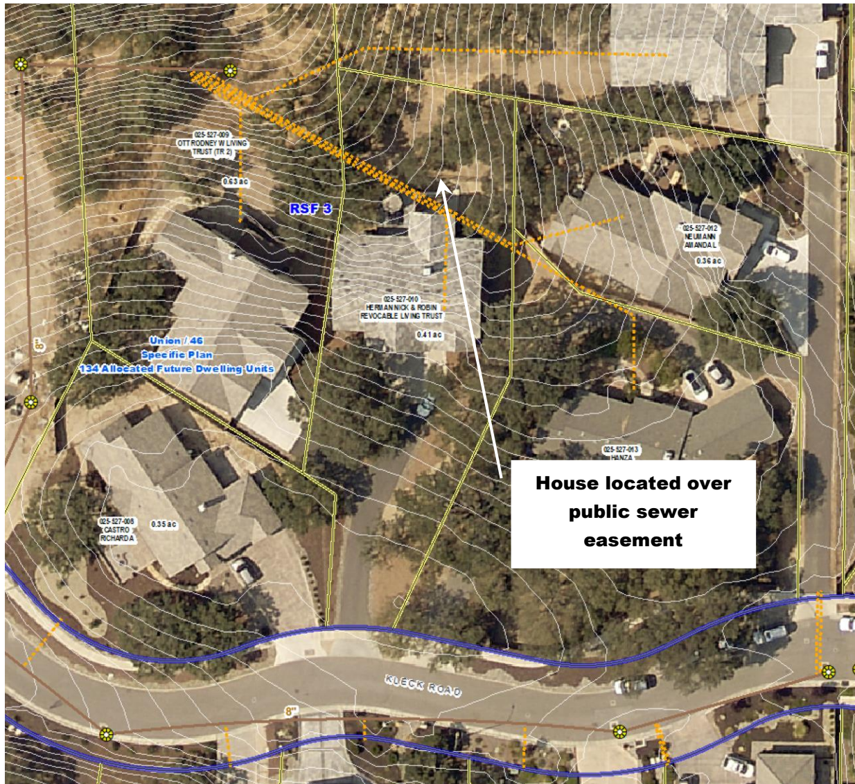
Figure 1a – Site Photo Showing 2016 Kleck House located in Existing Public Sewer Easement