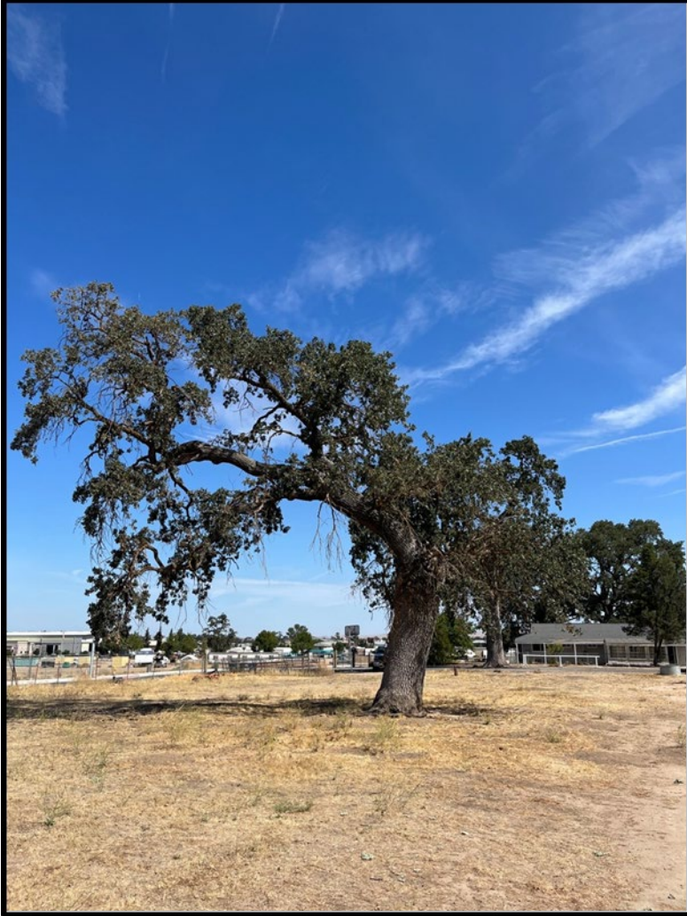
Photo 6 – Tree 3 in 2022. Outwardly, the tree appears to be moderately healthy but internal rot made it structurally unstable.