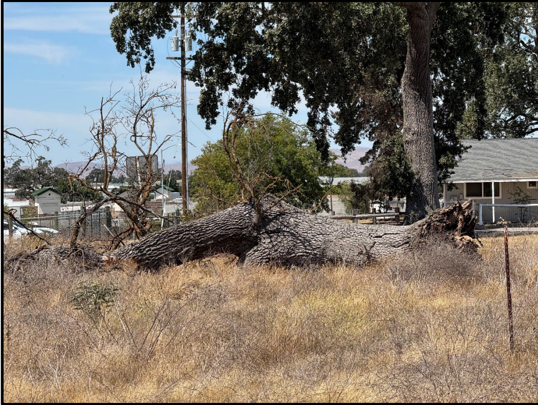
Photo 7 – Tree 3 – July 2025. The tree has died due to root rot and failed because of internal decay and root rot.