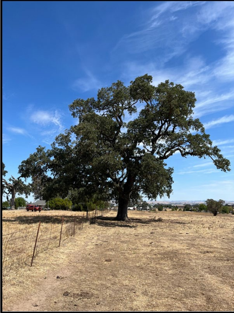
Photo 4 – Tree 2 in 2022. Outwardly, the tree appears to be healthy but internal rot makes it structurally unstable.