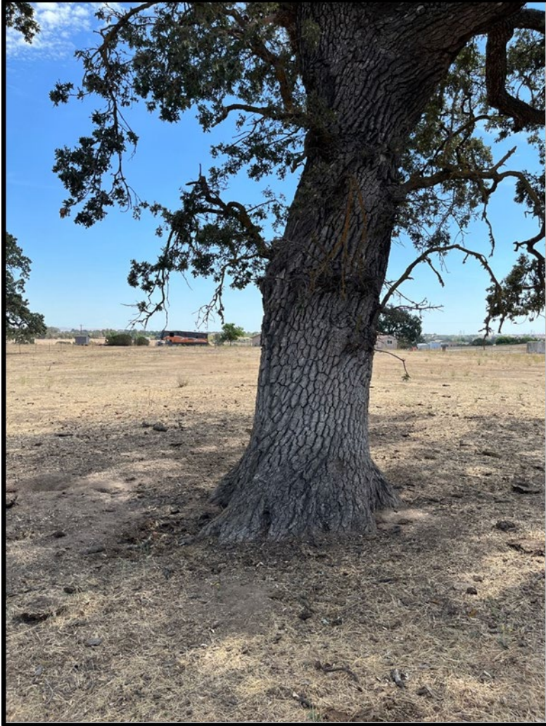
Photo 3 – Tree 13 with bulging root-crown indicating possible butt-rot.