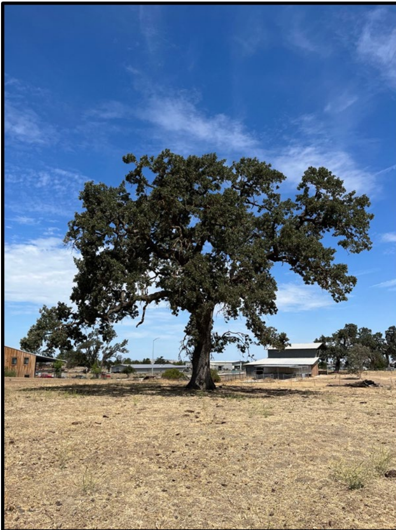
Photo 1 – Tree 13 with view to northeast. Outwardly, the tree appears to be healthy but internal rot makes it structurally unstable.