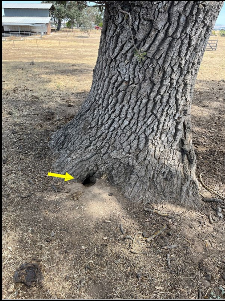
Photo 2 – Tree 13 with root decay cavity on south side of tree indicated by arrow.