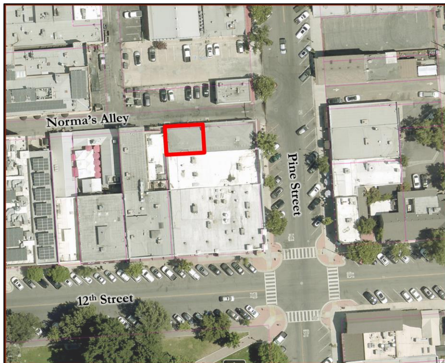
Aerial photo of location of 842 Norma's Alley

The project as proposed is for consideration of a Conditional Use Permit (CUP) for on-site beer and wine sales at an existing 860 sq. ft. retail space located at 842 Norma's Alley. This space was previously occupied by a wine-tasting venue, with the applicant proposing usage of the existing layout of the space. No external or internal construction is proposed.