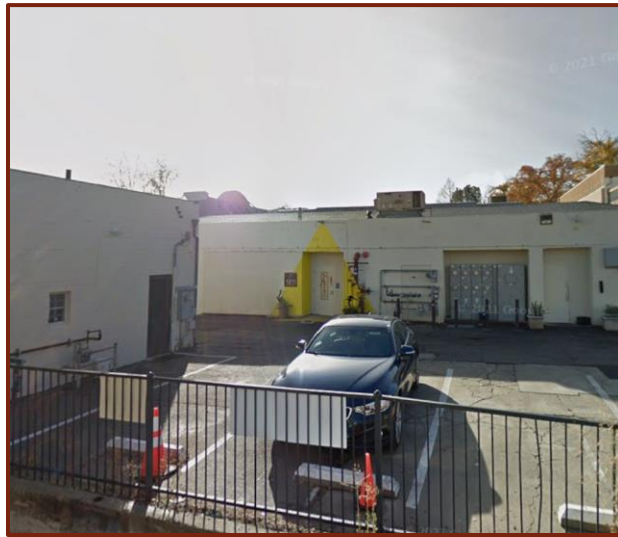
View of primary entrance on Norma's Alley

The primary entrance to the space is located on Norma's Alley, a paved alleyway between Park and Pine Streets that is fully accessible by both pedestrians and vehicles. The entrance is approximately 40 feet west of the alley's intersection with Pine Street. The site is additionally accessible from 13 th Street via a secondary alley, which connects to Norma's Alley mid-block. Section 5.7.2.H.2 of the Uptown/Town Centre Specific Plan states, "[d]owntown buildings not meeting current parking requirements that are replaced or reconstructed, shall not be required to provide more on-site parking than existed at the time of demolition or remodel. Expanded floor area beyond what previously existed shall be subject to downtown parking requirements." No expansion of floor area beyond what previously existed is proposed, so no additional parking is required. Parking for the location is provided through both on-street parking stalls and public parking lots located throughout Downtown.