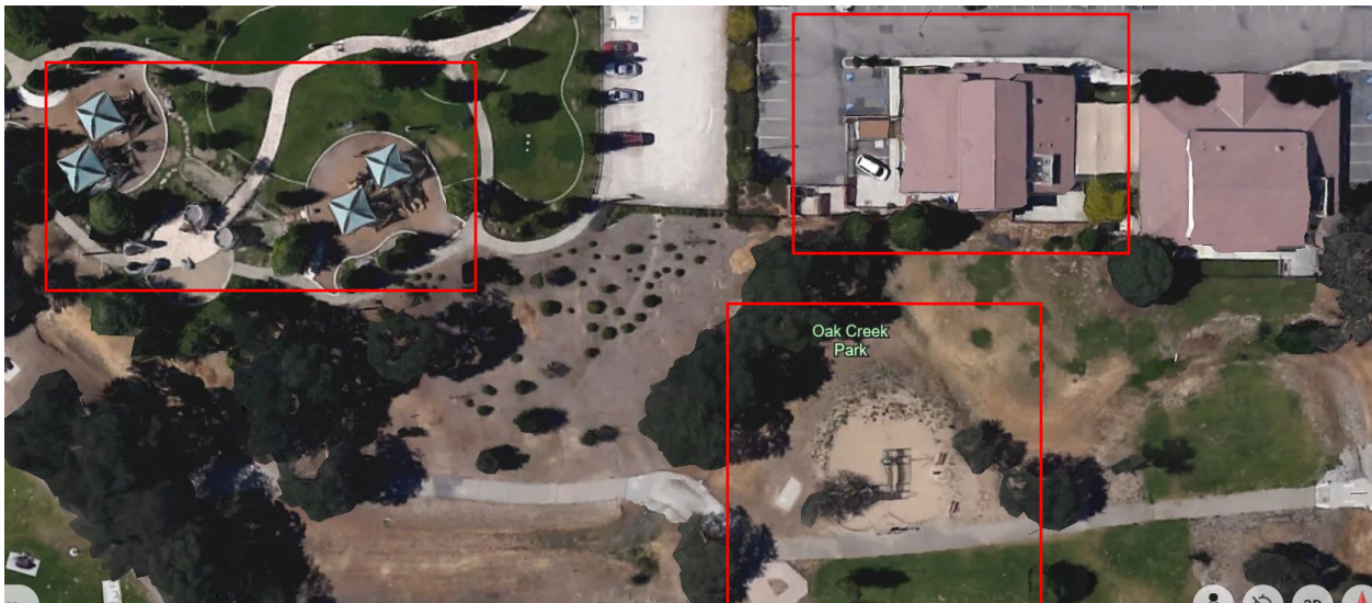
Figure 2 Oak Creek Park Sandbox, Sherwood Forest Playground, Veterans Memorial Building

One area of interest for such a memorial is a vacant circular sandbox immediately behind the Veterans Memorial Building. Due to safety issues, the playground in this sandbox was removed in 2022. With a limited budget and an active playground at the adjacent Sherwood Forest Park approximately 400 ft from the vacant sandbox, there is currently no replacement plan in place.